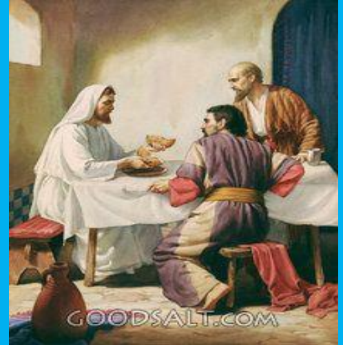
"HE TOOK BREAD, BLESSED AND BROKE IT!"